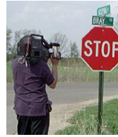
The infamous Bray Road sign

she quickly retreated to her car. She jumped in and was attempting