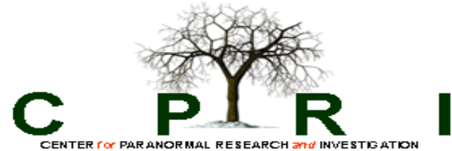
The New CPRI Logo