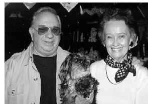
Ed and Lorraine Warren with their dog Gizmo.