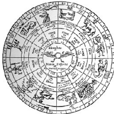
This is the zodiac wheel

The zodiac is divided into twelve zones of the sky, each named after the constellation that originally fell within its zone (Taurus, Leo, etc.). The apparent paths of the sun, the moon, and the major planets all fall within the zodiac. Because of the precession of the equinoxes, the equinox and solstice points have each