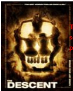
The Descent poster

The movie starts off by introducing us to a tight-knit trio of friends: women who've known each other forever and who vacation together every year, each thrilling adventure topping the last. But this time, something unexpected happens.