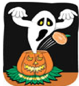
It's that time of the year again!

You can find a list of Halloween happenings in the Old Dominion - if you know of one that isn't listed on the page then please email appropriate listing information to bobbie@viriniaghosts.com