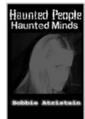
The cover of Bobbie Atristain's new book "Haunted People, Haunted Minds". You can buy it by visiting http://lulu.com/cpri