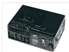
Marantz recorder state of the art equipment

excellent results from our Marantzes that various