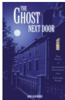
Book cover for the Ghost Next Door

Please visit Amazon.com to order this book.