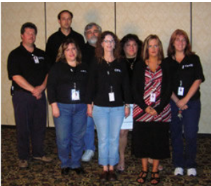
CPRI members pose for the camera

The food was awesome and everyone had a great time talking to the speakers at the banquet. There were also many door prizes given out during the banquet for the attendees. Over 140 people joined the CPRI crew to celebrate our 6th birthday which made it all the more special.