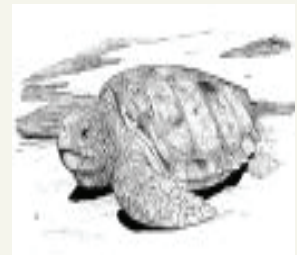
Turtle for paranormal research?

phenomena recording onsite network). This will allow us to leave equipment at locations for extended periods of time and we are a system that can be internet connected (where available) so we can remotely dial in to download data logs and even watch the location real-time. A prototype is in development so keep checking for updates.