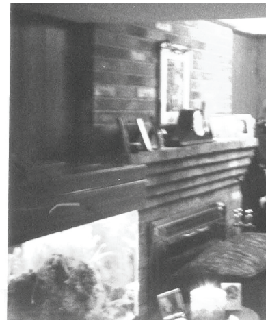
Picture taken at an investigation (please note to see the original in color go to centerpri.org )

Wanna know more? Go to http://virginiaghosts.com and click on Research.