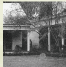
Supposed image of ghostly Chloe @ the Myrtles taken in the mid 1990s.

was quite surprised when the lady (who I had watched being interviewed about the ghost on various TV