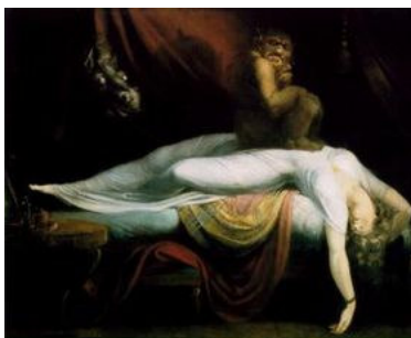
This painting represents sleep paralysis.

Wanna read more —visit viriniaghosts.com/3_mistakes.pdf