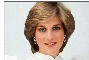
Is Princess Di speaking from the grave?

will enrage Diana's closest friends, who are already furious the psychic has cashed in by writing two books about Diana and holding a televised "séance" in which she tried to contact her spirit.