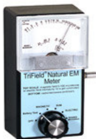
The TriField is considered the “best” EMF meter to use for research.

However there is merit to using an EMF meter on a paranormal investigation. It has been scientifically proven using the sci-