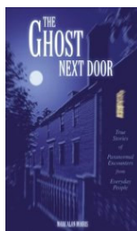
The Ghost Next Door

As you make your way through these and other genuinely spooky stories, you'll proba-