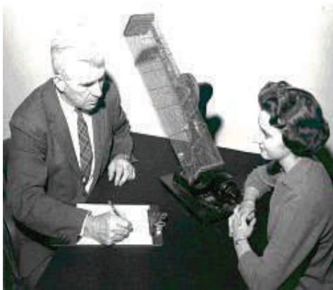
JB Rhine conducting a PSI experiment.